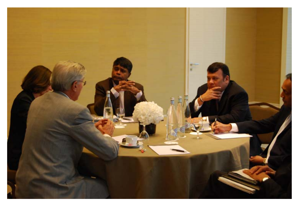
Sri Lankan delegation meeting the Heads of the International Organization for Migration